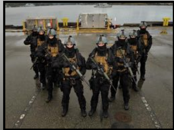
Team 2 - TIGER