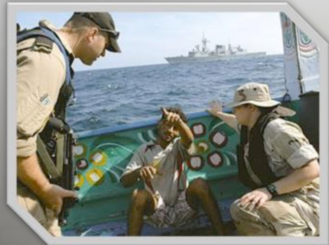
OP ARTEMIS (2012 - 2013)