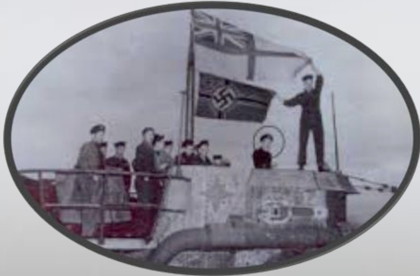
Royal Canadian Navy (11 May 1945)