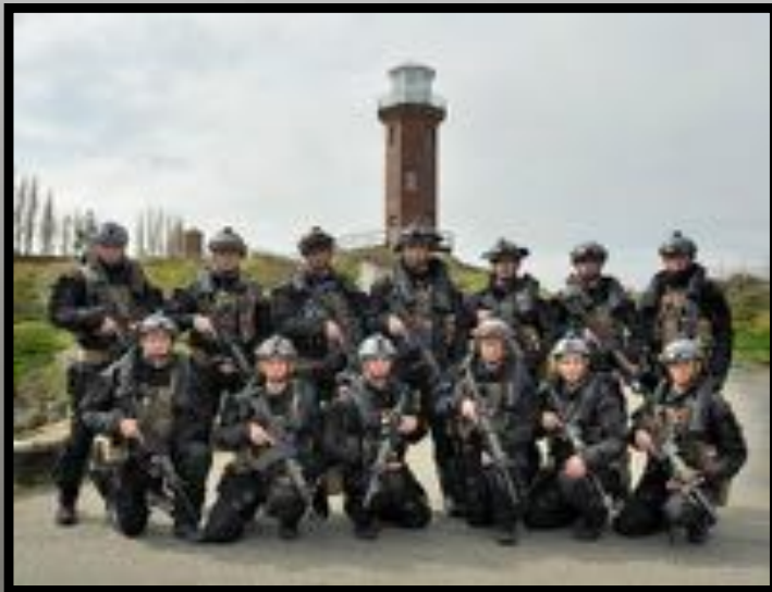
Team 1 - MAKO