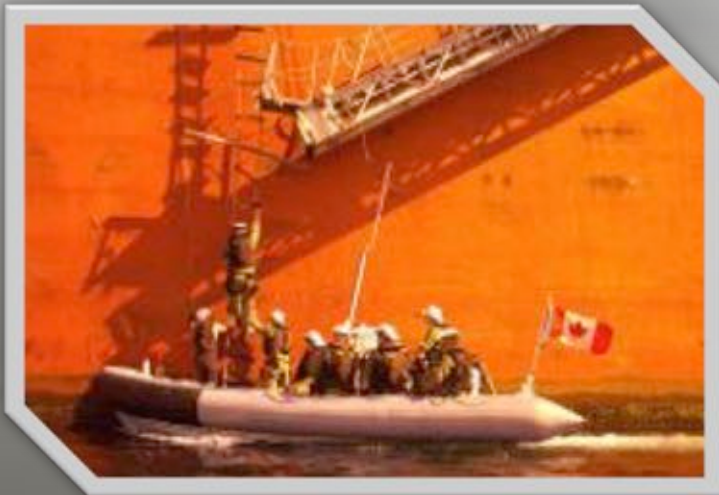
OP APOLLO (2001 - 2003)