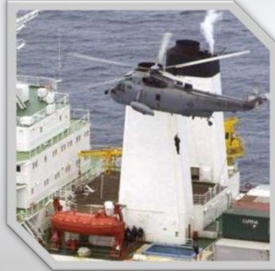
OP MEGAPHONE (06 Aug 2000)