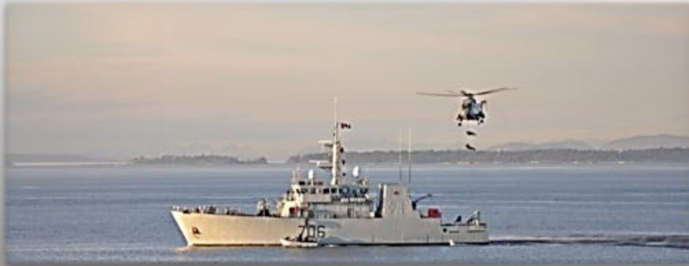
EOB POC EX – September 2012

General W.J. Natynczyk, CDS , 11 August 2011