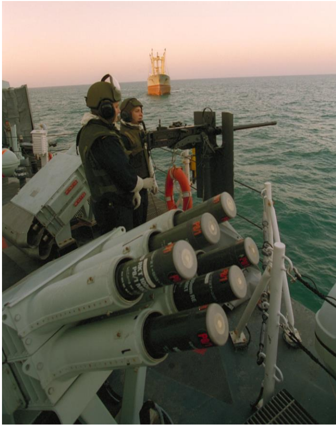
▲ Regina port guns crew closed up on a .50 cal machine gun. Chaff rockets are in the foreground (passive anti air-to-surface missile defence system). Ship is at Action Stations for a boarding. The target ship is in the background.

Immediately following that demanding anti-smuggling mission in the Gulf, I witnessed Regina facing yet another challenge. Navigating the Strait of Hormuz by night proved to be an experience that would validate the overall skills and abilities of the ship and her crew. Sailing through such a volatile and hostile checkpoint successfully tested all systems on board