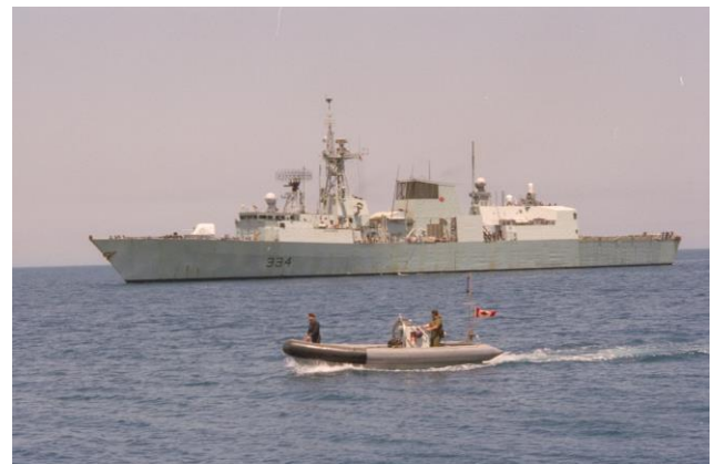
▲ HMCS Regina with its Rigid-Hull Inflatable Boat used for boarding operations in the foreground.